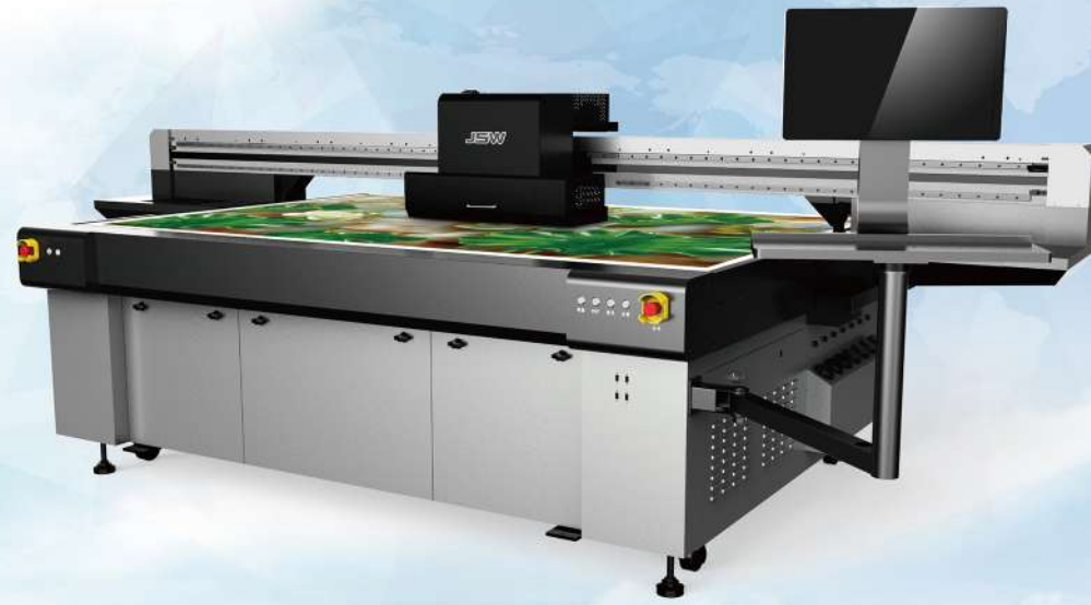
JSW Industrial Flatbed Printer (Model: F2513G/F3020G) Ricoh Gen5 Grey Scale Industrial Level Printheads

■ Stable Running ■ Convenient Operation ■ Fine Quality Print ■ Wide Application ■ Environment-Friendly